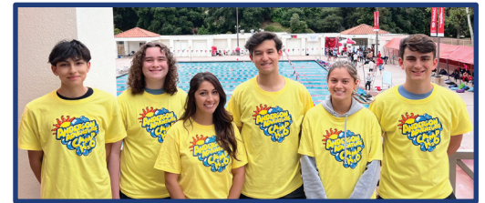
2nd Grade Counselors