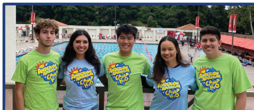
3rd-4th Grade Counselors