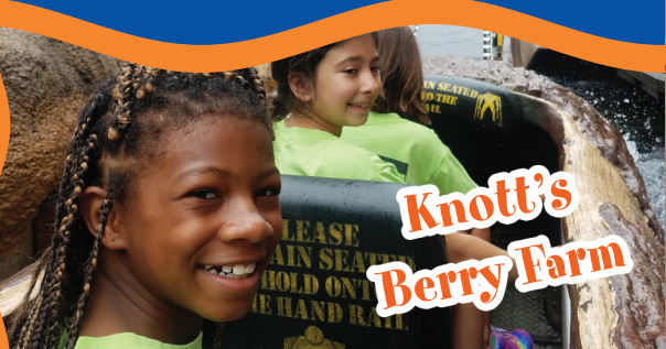
Knott's Berry Farm