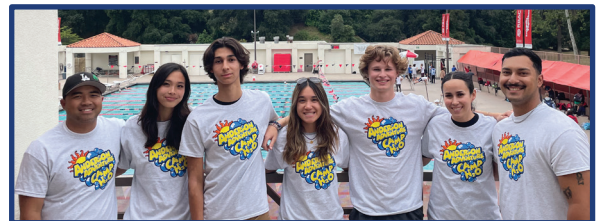
5th-6th Grade Counselors