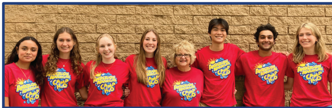
1st Grade Counselors

Art Teacher Weizmann Day School Teaching Assistant (18th summer at camp)